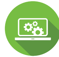
Central Management System (CMS) Software