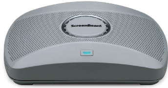
ScreenBeam 1000 EDU Wireless Display Receiver