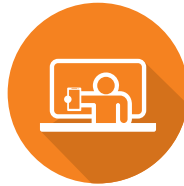
Classroom Commander Software License